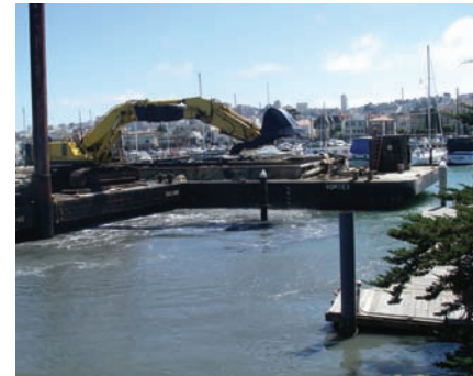
Summer 2010 Maintenance Dredging

Since the last successful public meeting in October 2009, the San Francisco Marina West Harbor Renovation Project has been making steady progress. Maintenance dredging was performed in summer 2010. Construction for the complete renovation is expected to begin in early 2011.