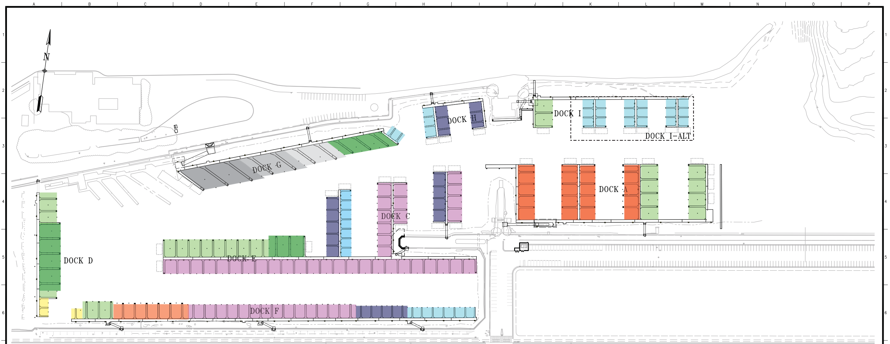
1 MARINA MAP SK-001 SCALE: 1"=80'